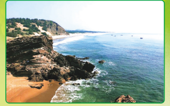
Near to Tourist Spot (Thanthadi & Muthyalapalem Beach )