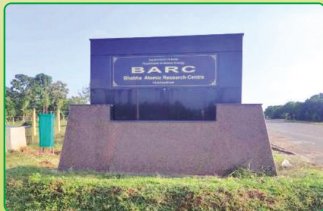
Beside BARC (BARC Main Gate)