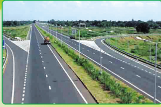
Very Near to Visakha to Chennai Coastal Corridor