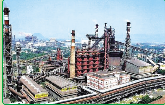
Near to Vizag Steel Plant