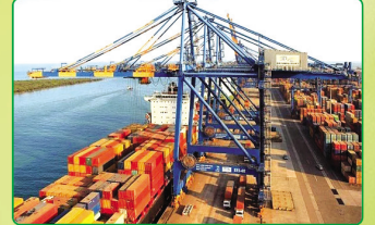
Close to APSEZ