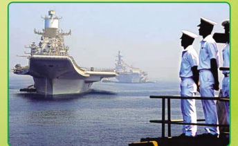
Naval Base Close to Site